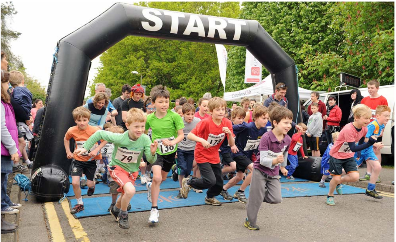
The Godalming Run 2013