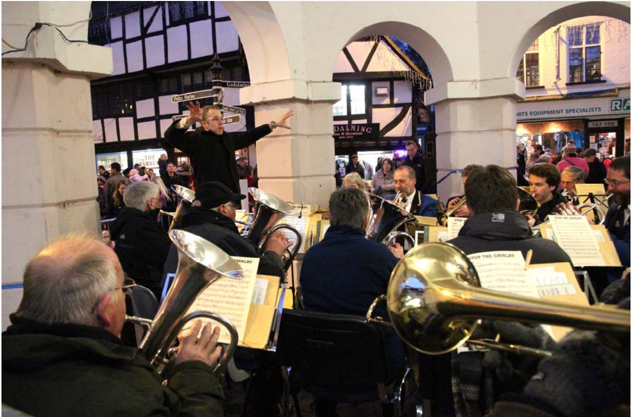
Christmas Festival 2013