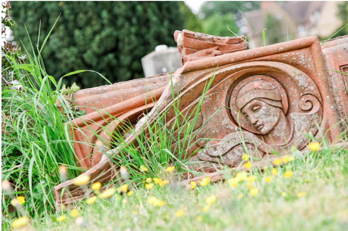
Terracotta Memorial at Nightingale Cemetery – Before and After Restoration