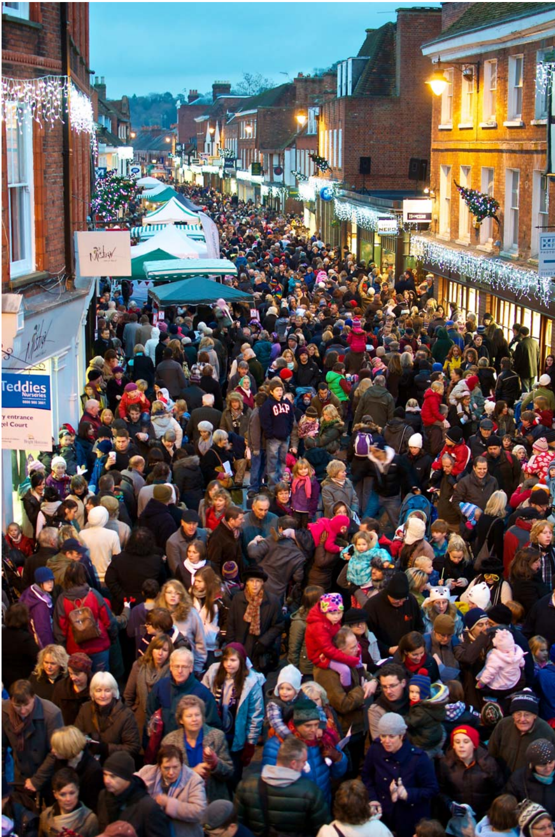
Christmas in Godalming 2010