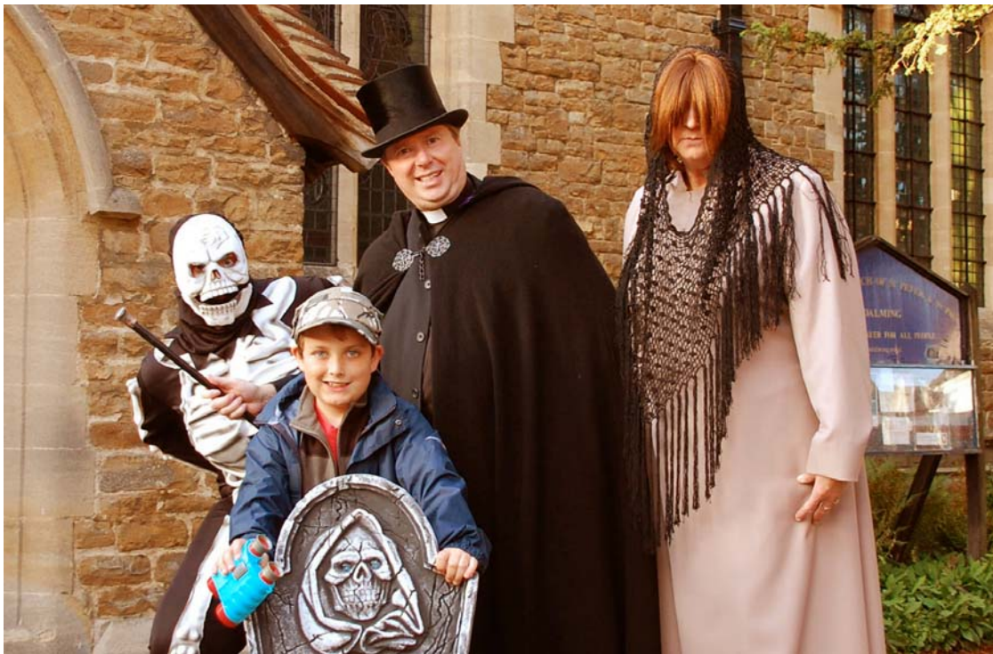
The Gory Ghost Walk