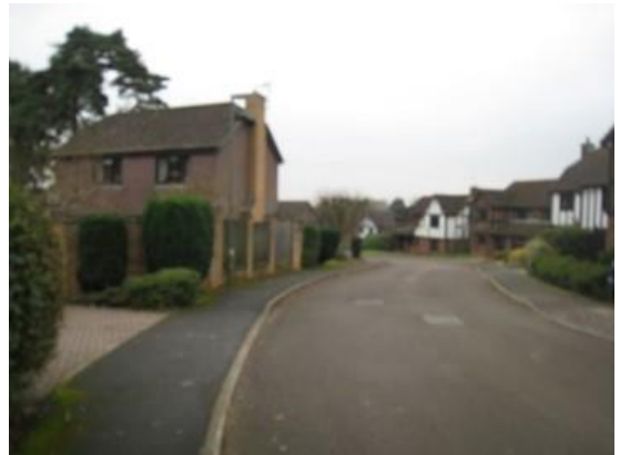
There were further increases in the town between the wars and from 1970s onwards

6.4 The photographs below show a development close to Church Street completed in 2016 that has used elements of the style and finishes without being a pastiche. This won a civic design award from the Godalming Trust in 2016.