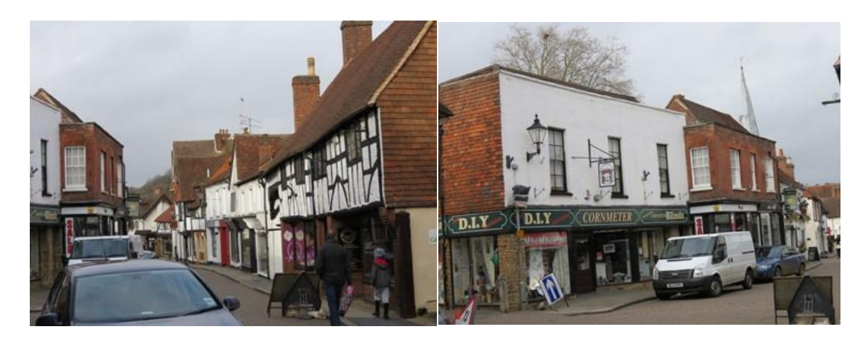
Church Street shows a range of the architectural styles from 16-20C