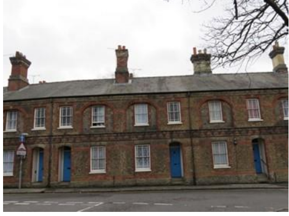
From the mid-1850s onwards the railway extended the materials used in building