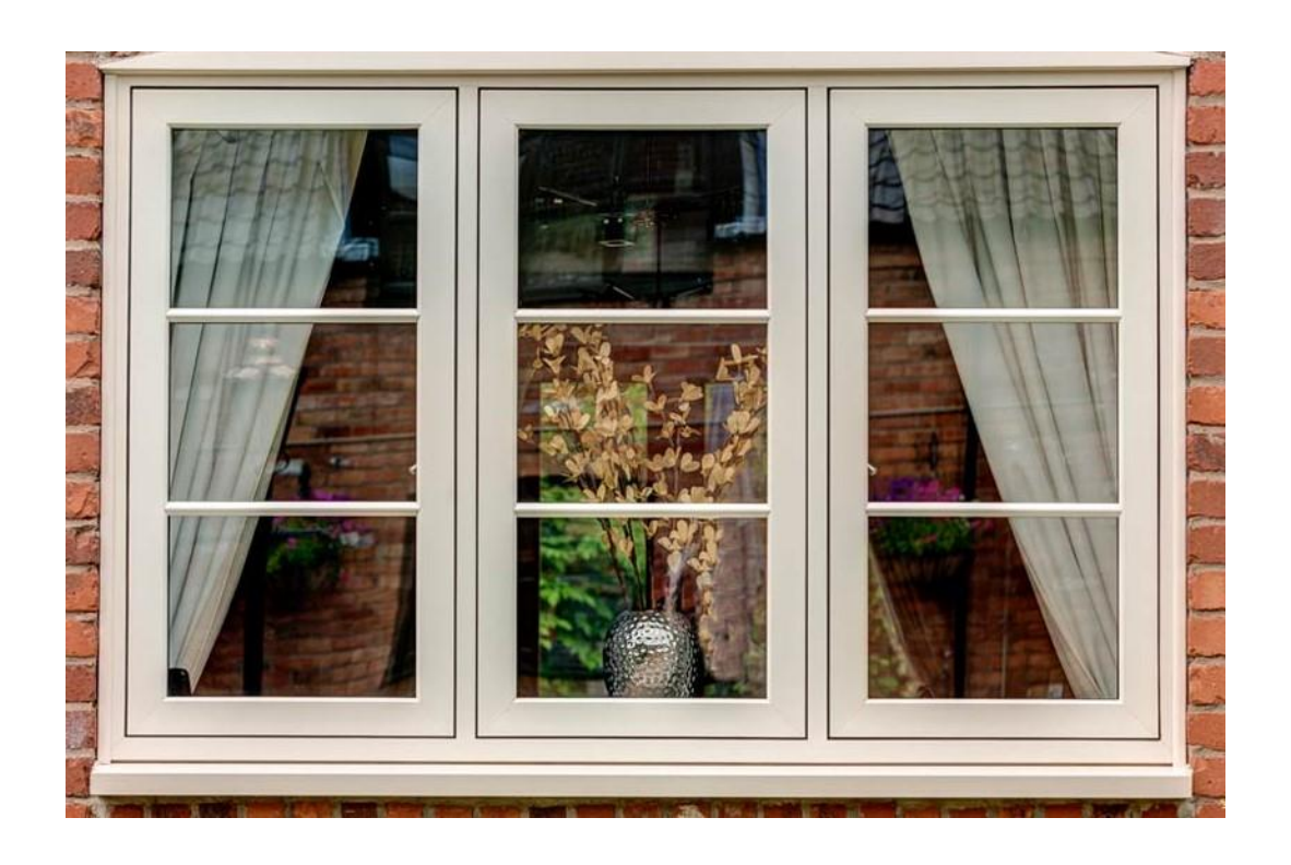
White uPVC double glazed 'flush sash' heritage style windows