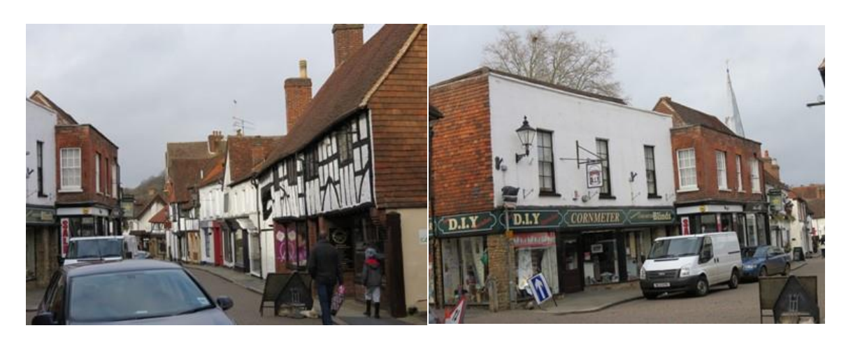
Church Street shows a range of the architectural styles from 16-20C