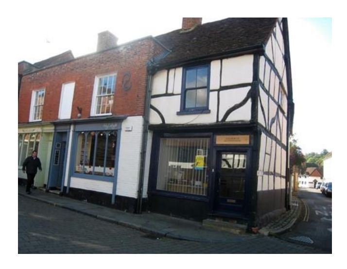
The Georgians added brick frontages to traditional timber framed buildings