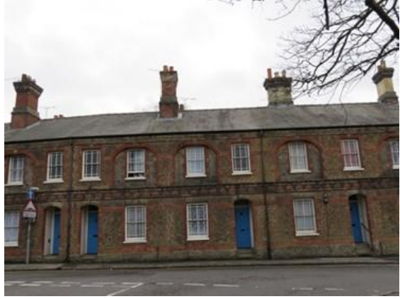
From the mid-1850s onwards the railway extended the materials used in building