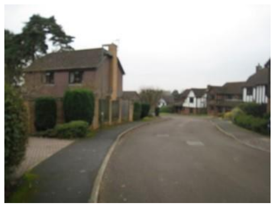
There were further increases in the town between the wars and from 1970s onwards

6.4 The photographs below show a development close to Church Street completed in 2016 that has used elements of the style and finishes without being a pastiche. This won a civic design award from the Godalming Trust in 2016.