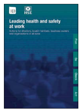
This is a web-friendly version of leaflet INDG417(rev1), published 06/13

Actions for directors, board members, business owners and organisations of all sizes