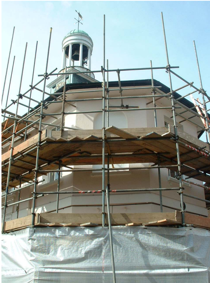
Scaffolding being erected around The Pepperpot - March 2010