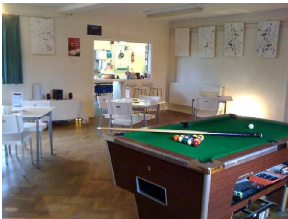
Café Trinity at the Wilfrid Noyce Centre