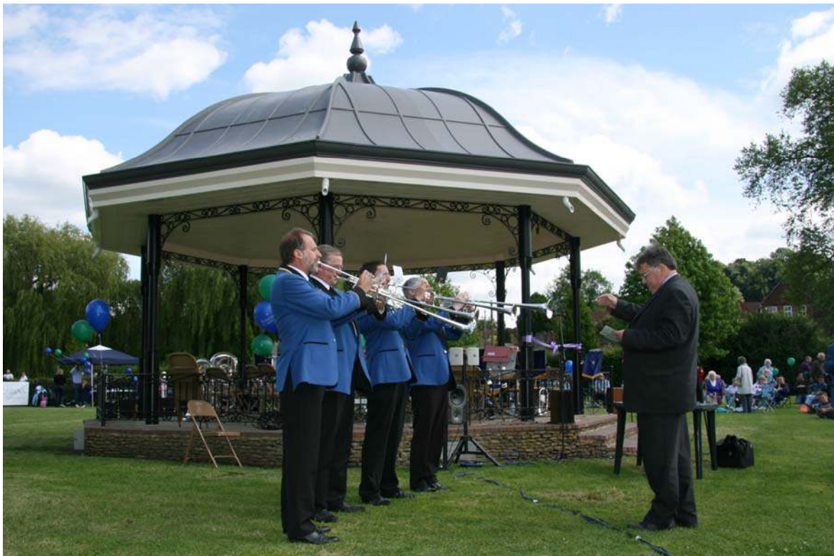
Fanfare for the new Bandstand Roof – 7 June 2009