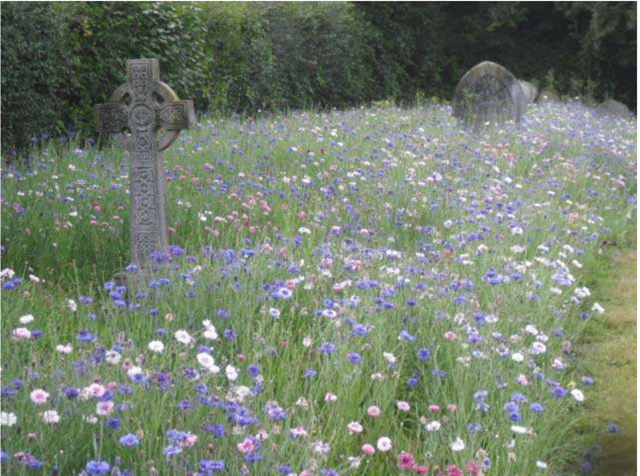
Wildflower area at Nightingale Cemetery – a haven for pollinating insects and butterflies.