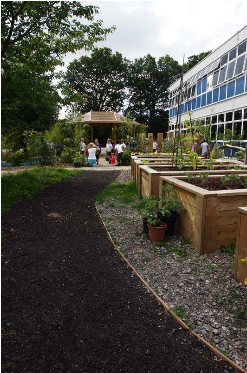
Godalming in Bloom at Loseley Fields Primary School