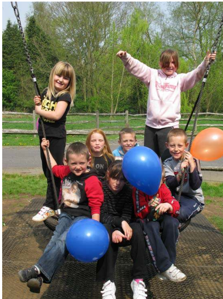
Opening of new play area at Northbourne 15 April 2009

In order to widen the range of organisations applying to the Town Council for grant support the Policy & Management Committee has reviewed the Council's procedures for considering grants. Full details of the Council's grants scheme can be found on the Town Council's website – www.godalming-tc.gov.uk or may be obtained from the Town Clerk (contact details at the back of this report).