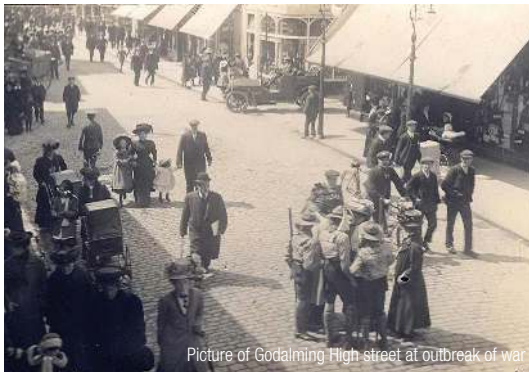
Picture of Godalming High street at outbreak of war

The First World War Centenary Partnership Programme is led by the Imperial War Museum (IWM)