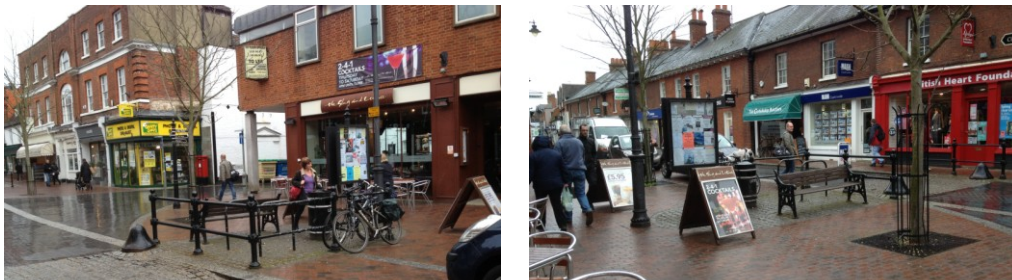
There are places in the High Street where the amount of street furniture now seems excessive

Even when the street is closed to general traffic, people tend to keep within the line of the pavements.