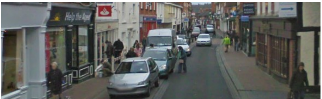
Though intended as a street for people, pedestrians effectively are kept to the widths of the original pavements