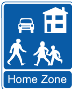
The UK Home Zone regulations sign

It may be that Surrey County Council will take the view that Godalming High Street is appropriate.