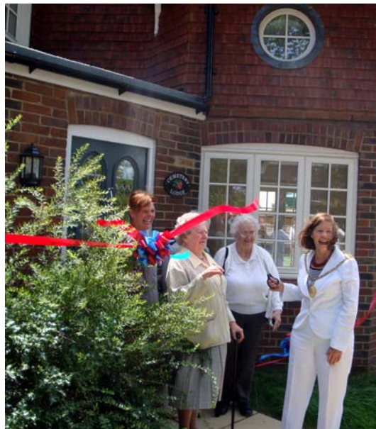
Opening the Refurbished Eashing Cemetery Lodge – August 2010