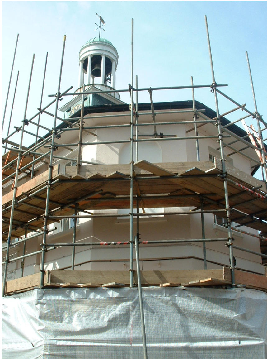
Scaffolding being erected around The Pepperpot - March 2010