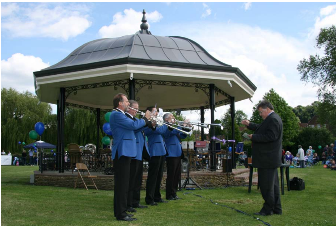
Fanfare for the new Bandstand Roof – 7 June 2009