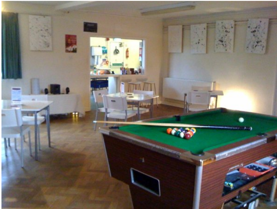
Café Trinity at the Wilfrid Noyce Centre