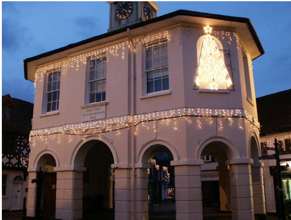
The Pepperpot with Christmas Lights