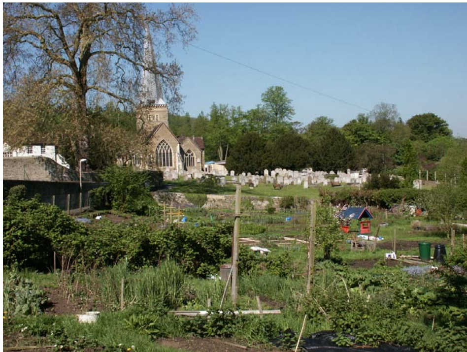
The Burys Allotments