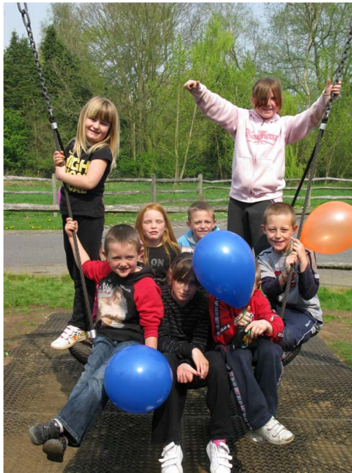
Opening of new play area at Northbourne 15 April 2009

In order to widen the range of organisations applying to the Town Council for grant support the Policy & Management Committee has reviewed the Council's procedures for considering grants. Full details of the Council's grants scheme can be found on the Town Council's website – www.godalming-tc.gov.uk or may be obtained from the Town Clerk (contact details at the back of this report).