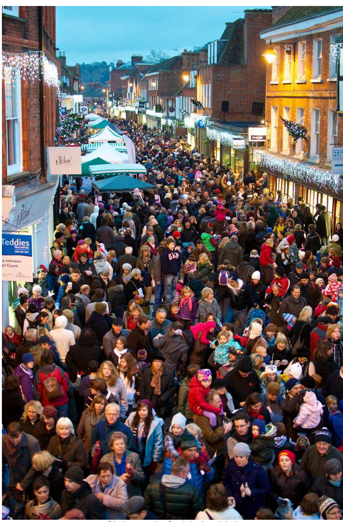
Christmas in Godalming 2010