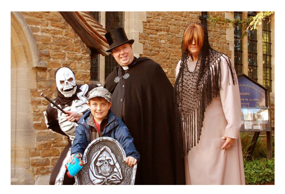
The Gory Ghost Walk