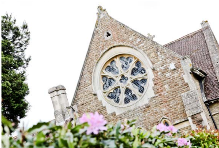
Eashing Cemetery 2011