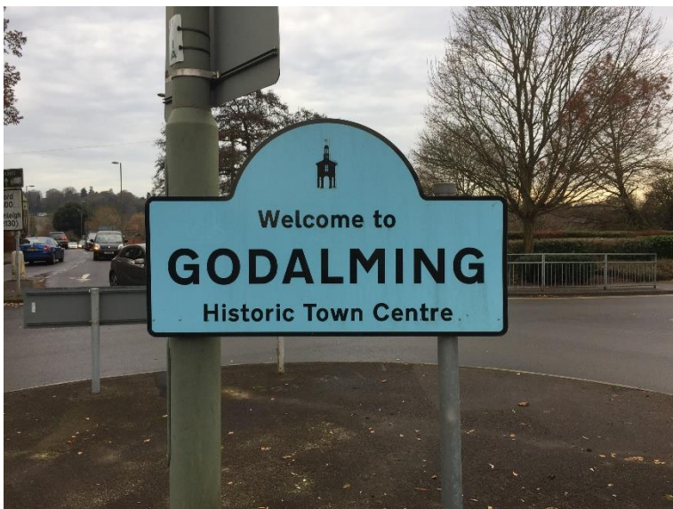
6. Town centre sign on the roundabout at the junction of Meadow, Bridge Road and Chalk Road