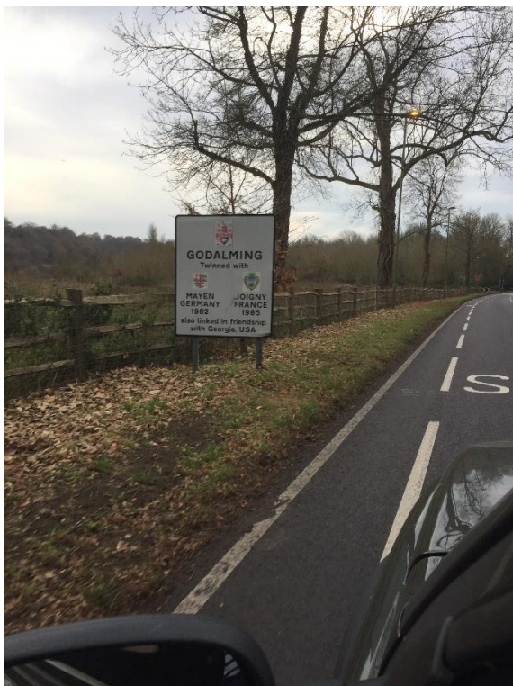
1. Town Boundary sign on the A3100 southwest bound opposite Broadwater Park

Four in total marking the boundary of the town (of the Godalming Civil Parish). These are sited on the A3100 southwest bound opposite Broadwater Park (1); on the A3100 Portsmouth Road northeast bound near Primrose Ridge (2); on the Brighton Road southbound near Home Farm Road (3) and on the Hurtmore Road near the car sales garage (4). These are shown in the photographs below. Numbers 2, 3 & 4 have been replaced recently while number 1 is older but remains in reasonable condition.