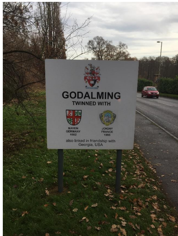
2. Town Boundary sign on the A3100 Portsmouth Road northeast bound near Primrose Ridge