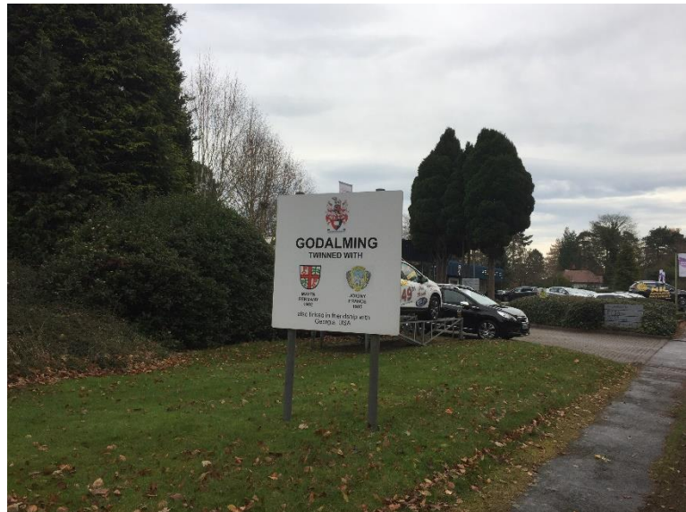
4. Town Boundary sign on the the Hurtmore Road near the car sales garage