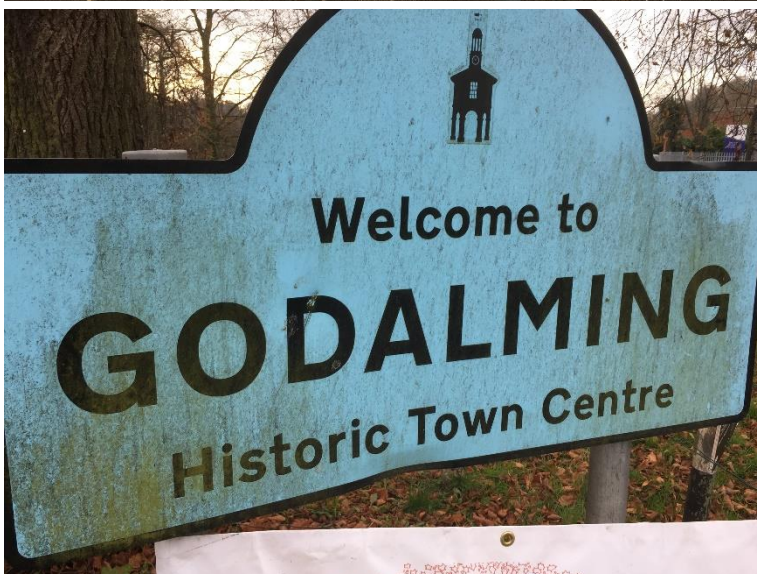
7. Town centre sign at the junction of Borough Road and Chalk Road.