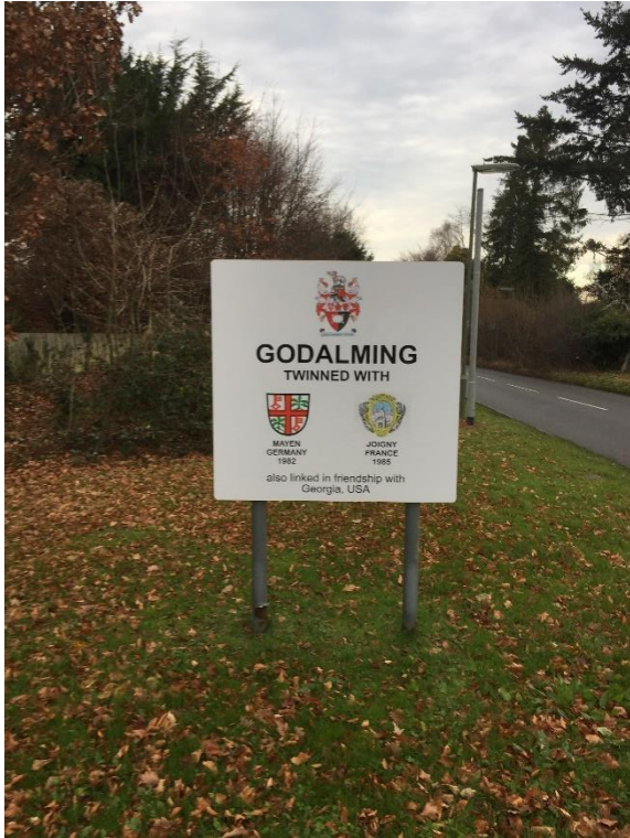
3. Town Boundary sign on the Brighton Road southbound near Home Farm Road