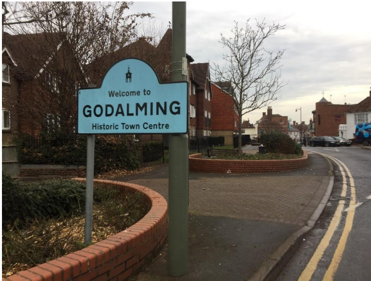
5. Town centre sign on Ockford Road near the Telephone exchange

Three in total installed in 2011 as described below: