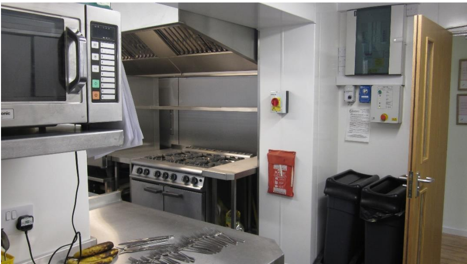
Farncombe Day Centre - Kitchen