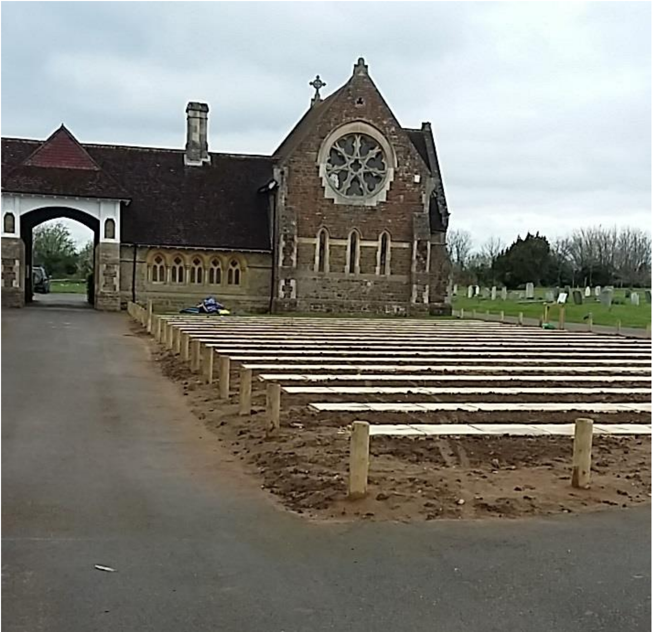
DEVELOPMENT OF NEW ASHES PLOTS – EASHING CEMETERY