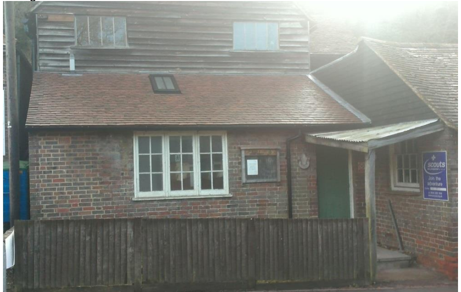
SS Peter & Paul Scout Hut Roof