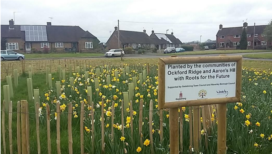
Roots For The Future - Tree Planting