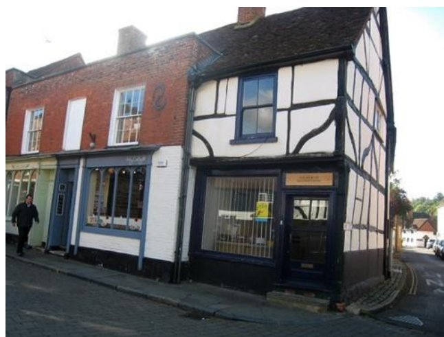
The Georgians added brick frontages to traditional timber framed buildings