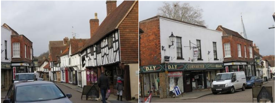
Church Street shows a range of the architectural styles from 16-20C