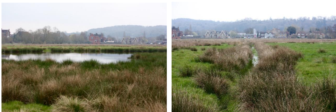
The unique Lammas Lands in the heart of Godalming, a quintessential flood plain