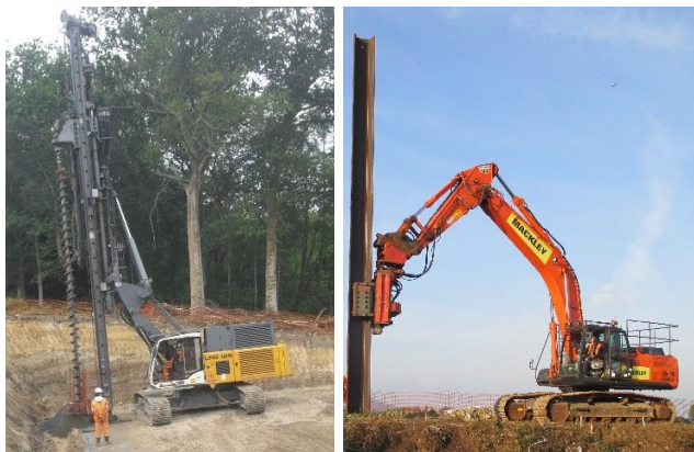
Auger (drill) rig