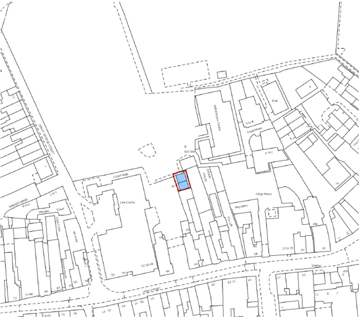
Plan 1. Do not scale.