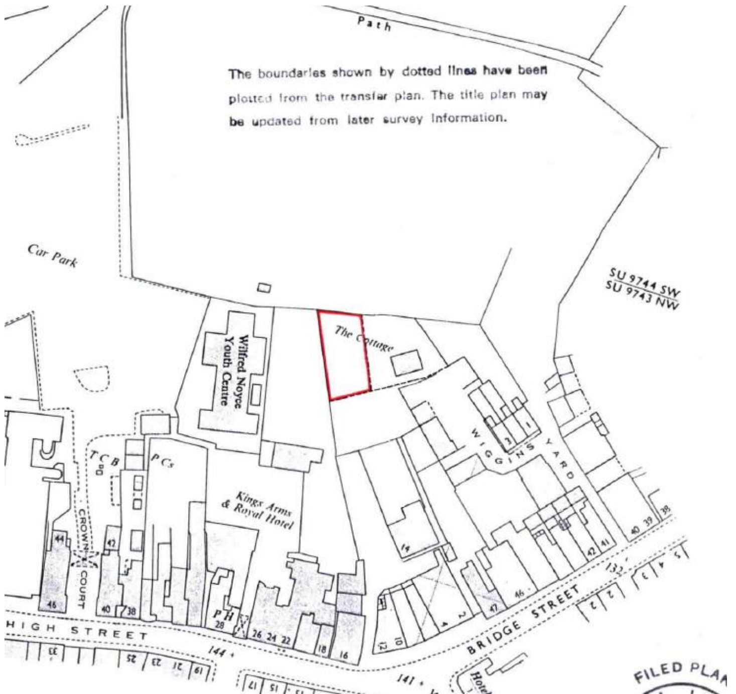
Plan 1. Do not scale.